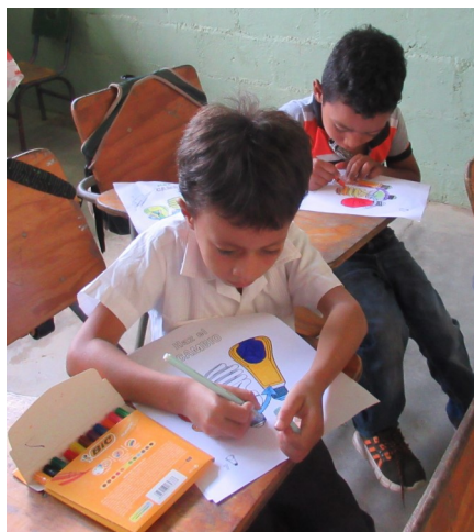
Students work on posters for Green Week

Green week at the Plan Grande Elementary School was an opportunity to celebrate the installation of solar energy at the school (funded by a UCC Genesis Fund grant) and to share information and teach about sustainable living and climate change. The educational goals were to develop math, science and technology skills through green living. Children worked on projects during the week to build awareness of climate change and to understand sustainable practices.