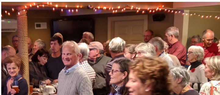
An enthusiastic crowd enjoys the music & food